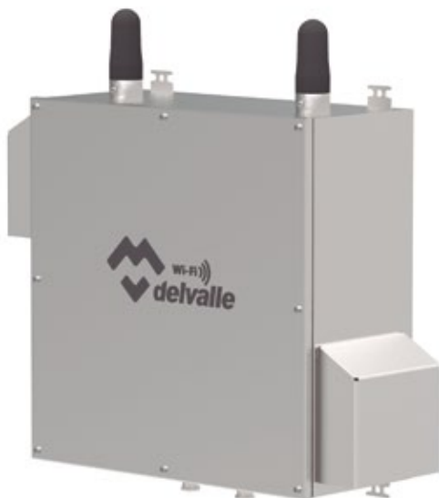
Example heat & cold solution

Designed to Allow Network Deployment Wireless in Foreign Areas