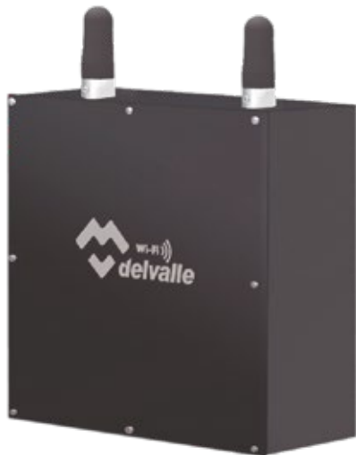
Example RAL 9005