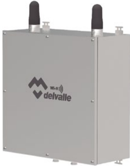
Example RAL 7035