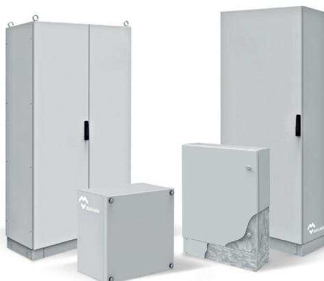
GALVANIZED STEEL ELECTRICAL ENCLOSURES