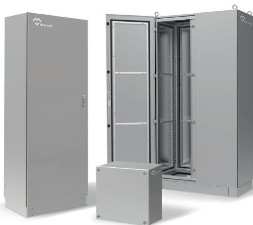
STAINLESS STEEL INDUSTRIAL ENCLOSURES

In Delvallebox we bear in mind that customers perceive the quality very clearly. In every product (for instance, in the enclosures here presented) safety and useful solutions are what customers value most.