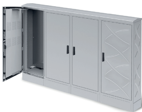
GLOBAL ELECTRICAL SOLUTIONS FOR URBAN AREAS