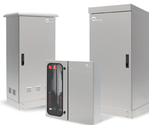
OUTDOOR ELECTRICAL ENCLOSURES