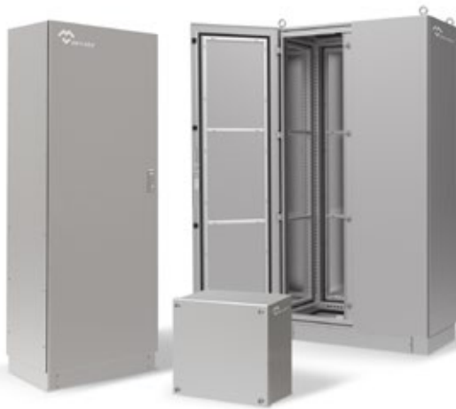
STAINLESS STEEL INDUSTRIAL ENCLOSURES

In Delvallebox we bear in mind that customers perceive the quality very clearly. In every product (for instance, in the cabinets here presented) safety and useful solutions are what customers value most.