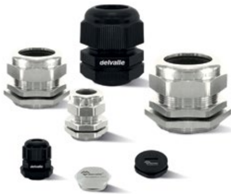
CABLE GLANDS FOR ELECTRICAL ENCLOSURES