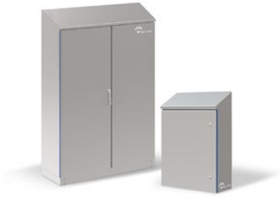
SLOPED ROOF ENCLOSURES - HYGIENIC