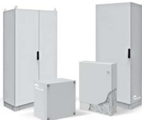
GALVANIZED STEEL ELECTRICAL ENCLOSURES