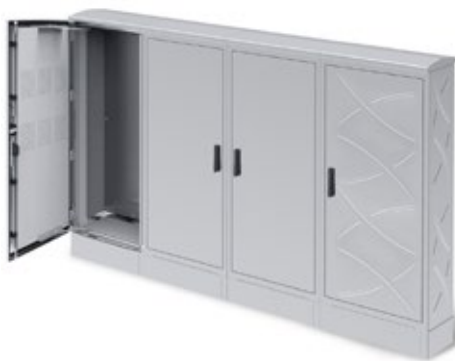
GLOBAL ELECTRICAL SOLUTIONS FOR URBAN AREAS