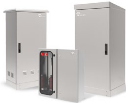
OUTDOOR ELECTRICAL ENCLOSURES