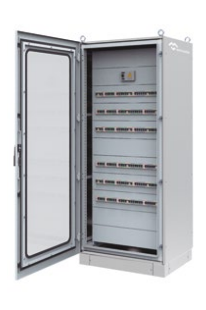
EMC ELECTRICAL ENCLOSURES SOLUTIONS