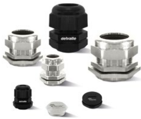
CABLE GLANDS FOR ELECTRICAL ENCLOSURES