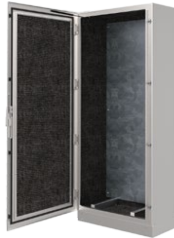
Tribeca without insulation