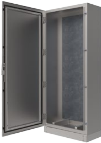
Tribeca with insulation