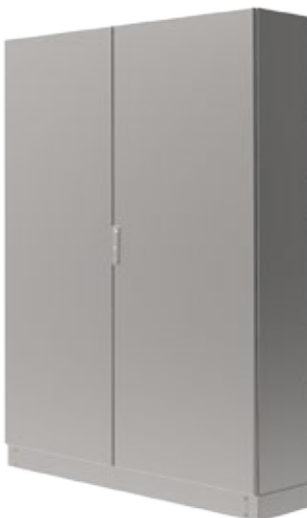
Tribeca with double doors