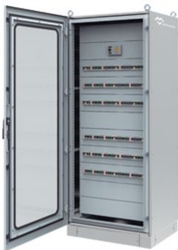
MODULAR DISTRIBUTION ENCLOSURES