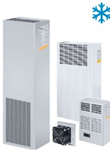
CLIMATE CONTROL COOLING FOR ELECTRICAL ENCLOSURES