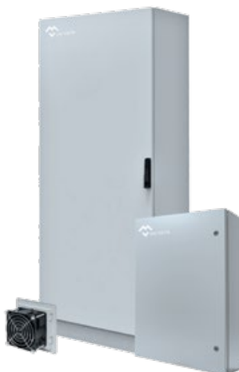
EMC ELECTRICAL ENCLOSURES SOLUTIONS