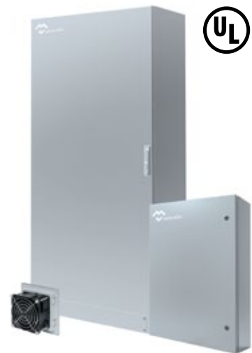
NEMA ELECTRICAL ENCLOSURE TYPE 1-3R-4X-12