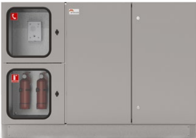
SOS post 3 modules