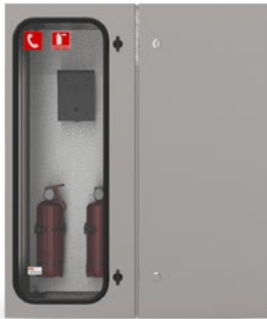
SOS post 2 modules