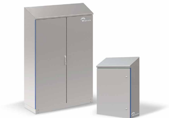
SLOPED ROOF ENCLOSURES - HYGIENIC