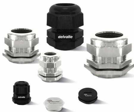
CABLE GLANDS FOR ELECTRICAL ENCLOSURES