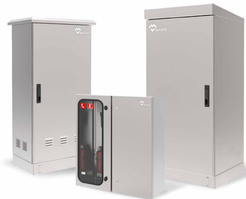
OUTDOOR ELECTRICAL ENCLOSURES