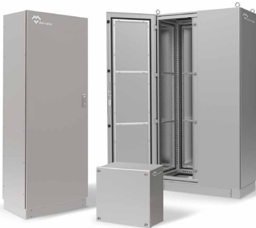
STAINLESS STEEL INDUSTRIAL ENCLOSURES

In Delvallebox we bear in mind that customers perceive the quality very clearly. In every product (for instance, in the enclosures here presented) safety and useful solutions are what customers value most.