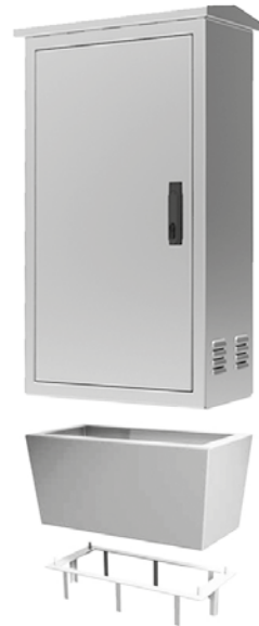
Detail of inclined plinths with mounting frame