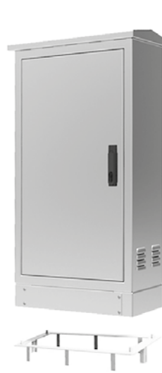
Detail of plinths with mounting frame

As can be seen in the picture, as an option, the plinth allows it to be fully fixed to ground movements so avoiding.