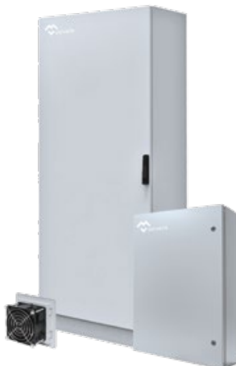
EMC ELECTRICAL ENCLOSURES SOLUTIONS