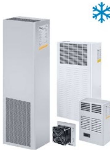
CLIMATE CONTROL COOLING FOR ELECTRICAL ENCLOSURES