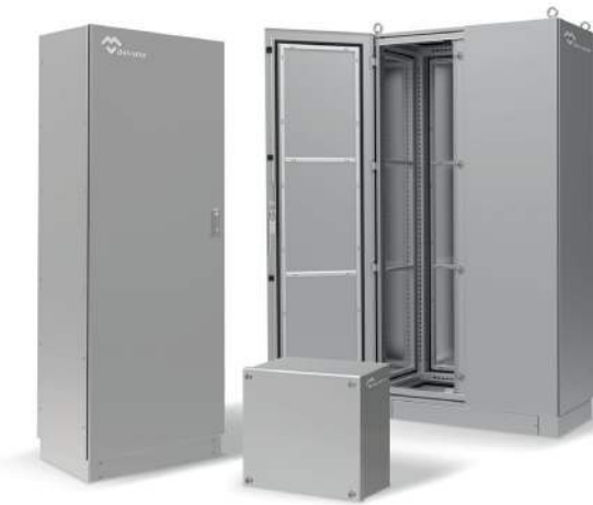
STAINLESS STEEL INDUSTRIAL ENCLOSURES

In Delvallebox we bear in mind that customers perceive the quality very clearly. In every product (for instance, in the enclosures here presented) safety and useful solutions are what customers value most.