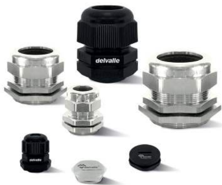
CABLE GLANDS FOR ELECTRICAL ENCLOSURES