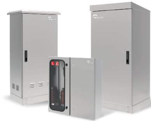
OUTDOOR ELECTRICAL ENCLOSURES