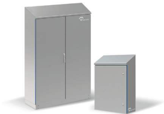
SLOPED ROOF ENCLOSURES - HYGIENIC