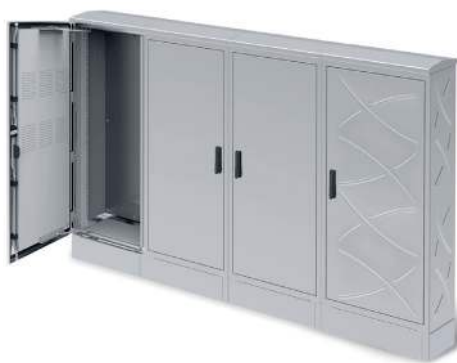
GLOBAL ELECTRICAL SOLUTIONS FOR URBAN AREAS