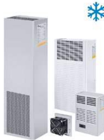
CLIMATE CONTROL COOLING FOR ELECTRICAL ENCLOSURES