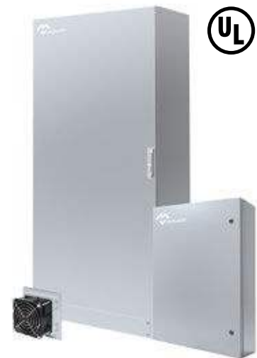
NEMA ELECTRICAL ENCLOSURE TYPE 1-3R-4X-12