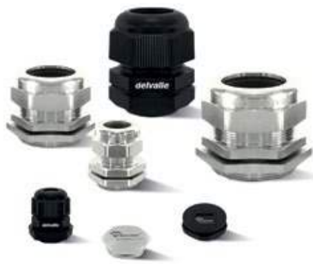
CABLE GLANDS FOR ELECTRICAL ENCLOSURES