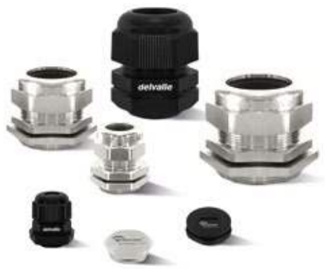
CABLE GLANDS FOR ELECTRICAL ENCLOSURES