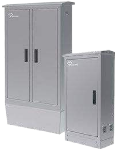
OUTDOOR HEAVY DUTY ELECTRICAL ENCLOSURES