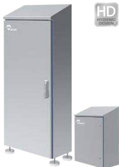
HYGIENIC DESIGN ENCLOSURES