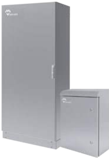
STAINLESS STEEL INDUSTRIAL ENCLOSURES