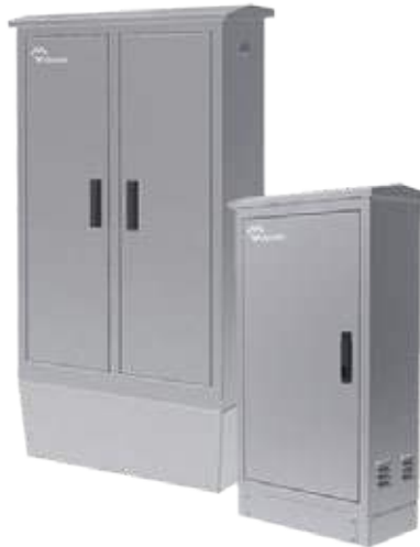
OUTDOOR HEAVY DUTY ELECTRICAL ENCLOSURES