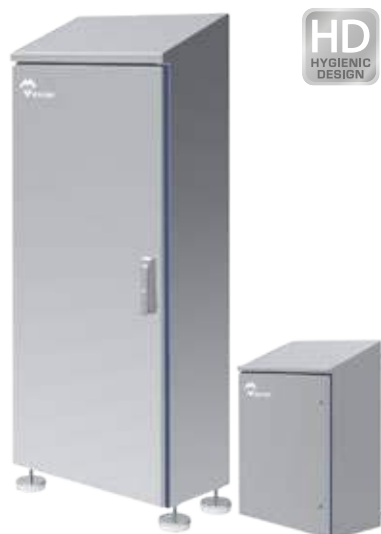
HYGIENIC DESIGN ENCLOSURES