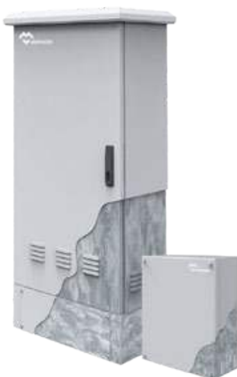
GALVANIZED STEEL ELECTRICAL ENCLOSURES