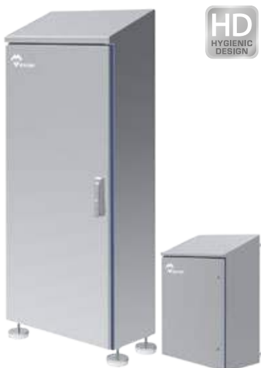
OUTDOOR HEAVY DUTY ELECTRICAL ENCLOSURES