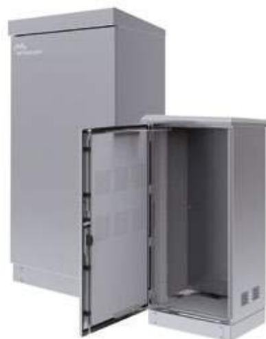
OUTDOOR TELECOM 19 RACKS & CABINETS