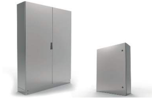
STAINLESS STEEL ENCLOSURES