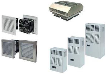
CLIMATE CONTROL SOLUTIONS