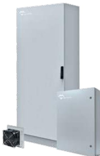
EMC ELECTRICAL ENCLOSURES SOLUTIONS