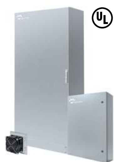
NEMA ELECTRICAL ENCLOSURES TYPE 1-3R-4X-12