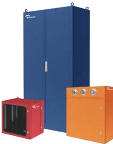
WATERPROOF SHEET STEEL ELECTRICAL ENCLOSURES