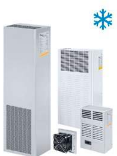
CLIMATE CONTROL COOLING FOR ELECTRICAL ENCLOSURES