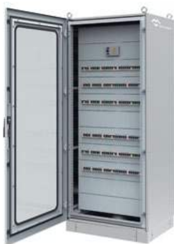
MODULAR DISTRIBUTION ENCLOSURES