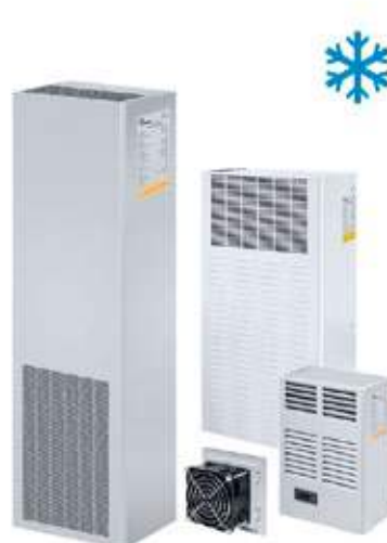
CLIMATE CONTROL COOLING FOR ELECTRICAL ENCLOSURES