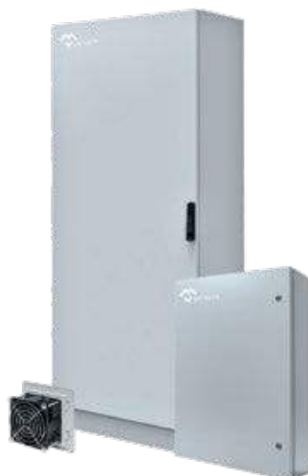
EMC ELECTRICAL ENCLOSURES SOLUTIONS