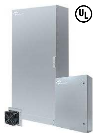
NEMA ELECTRICAL ENCLOSURE TYPE 1-3R-4X-12