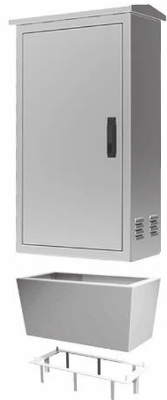
Detail of inclined plinths with mounting frame