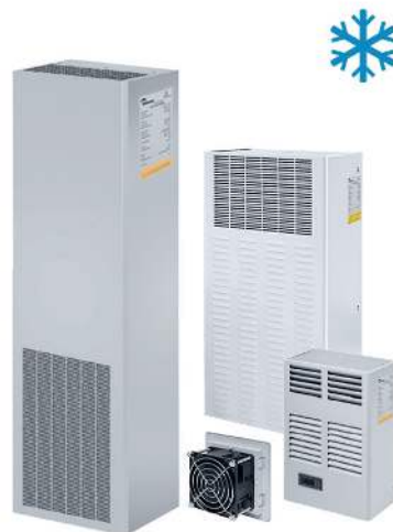
CLIMATE CONTROL COOLING FOR ELECTRICAL ENCLOSURES