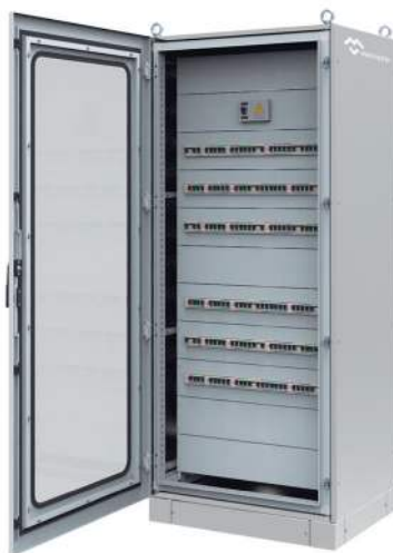
MODULAR DISTRIBUTION ENCLOSURES