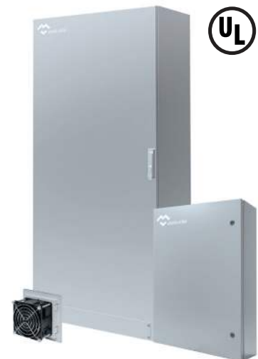
NEMA ELECTRICAL ENCLOSURE TYPE 1-3R-4X-12