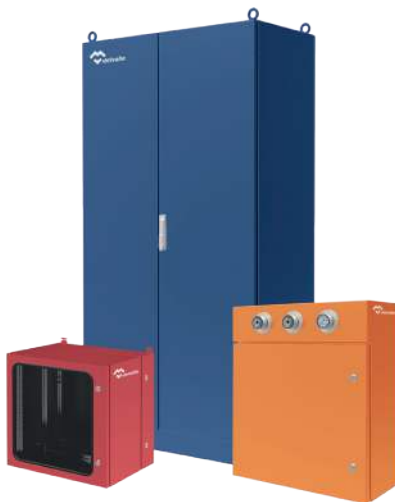
WATERPROOF SHEET STEEL ELECTRICAL ENCLOSURES