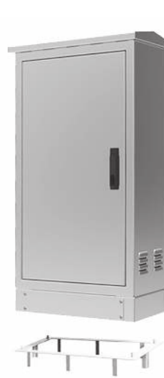
Detail of plinths with mounting frame

As can be seen in the picture, as an option, the plinth allows it to be fully fixed to ground movements so avoiding.