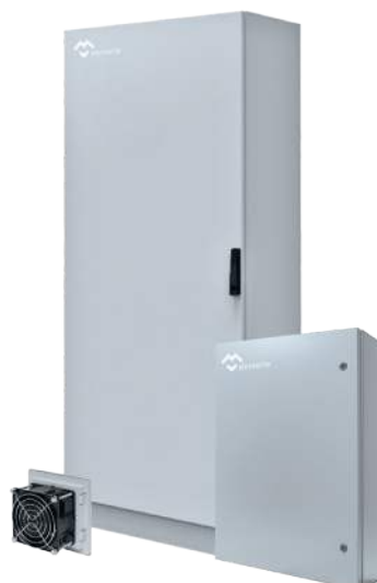
EMC ELECTRICAL ENCLOSURES SOLUTIONS