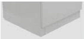
PLINTHS AT BASE