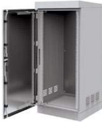
SELF-COOLED AND WITH VENTILATION BRACKETS