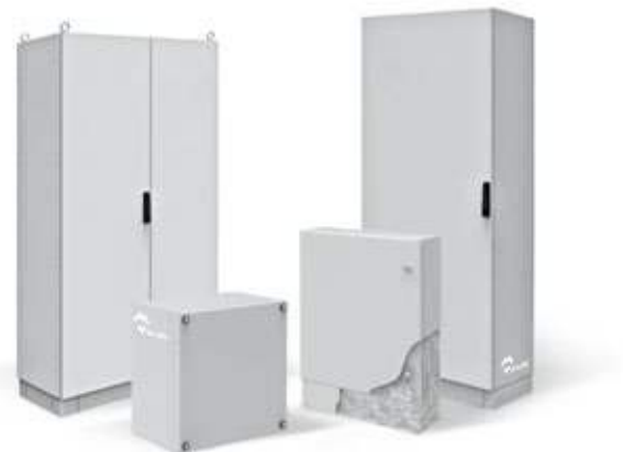
GALVANIZED STEEL ELECTRICAL ENCLOSURES