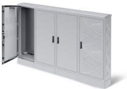
GLOBAL ELECTRICAL SOLUTIONS FOR URBAN AREAS