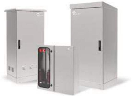
OUTDOOR ELECTRICAL ENCLOSURES