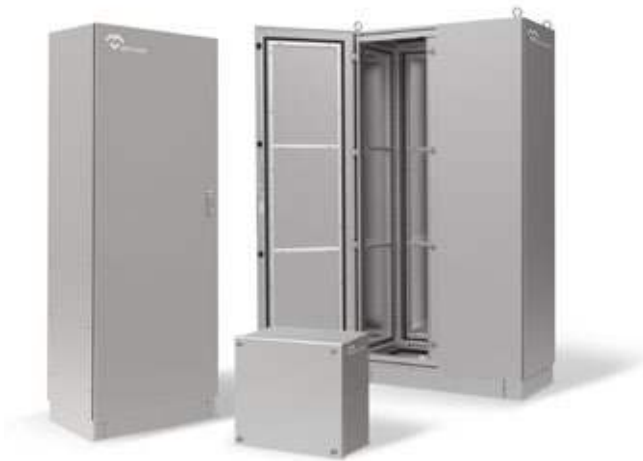
STAINLESS STEEL INDUSTRIAL ENCLOSURES

In Delvallebox we bear in mind that customers perceive the quality very clearly. In every product (for instance, in the cabinets here presented) safety and useful solutions are what customers value most.