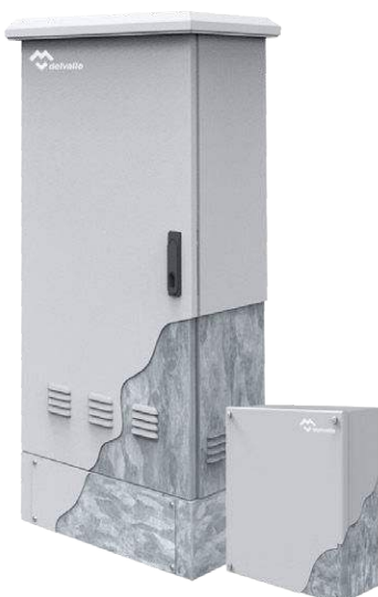
GALVANIZED STEEL ELECTRICAL ENCLOSURES