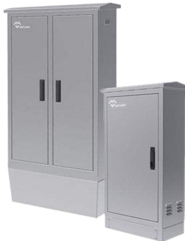
OUTDOOR HEAVY DUTY ELECTRICAL ENCLOSURES