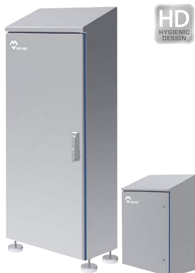
HYGIENIC DESIGN ENCLOSURES