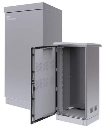
OUTDOOR TELECOM 19 RACKS & CABINETS