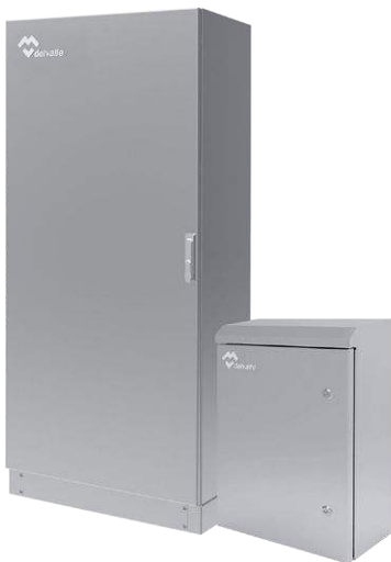
STAINLESS STEEL INDUSTRIAL ENCLOSURES