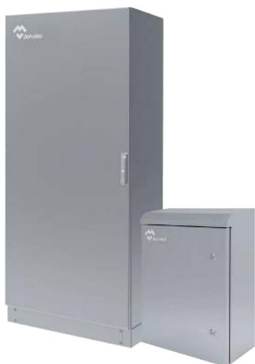
STAINLESS STEEL INDUSTRIAL ENCLOSURES