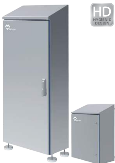
HYGIENIC DESIGN ENCLOSURES