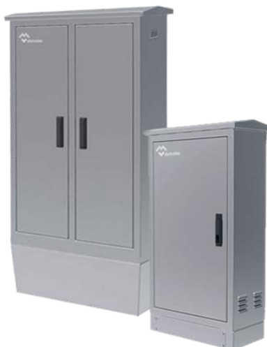
OUTDOOR HEAVY DUTY ELECTRICAL ENCLOSURES