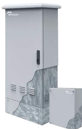
GALVANIZED STEEL ELECTRICAL ENCLOSURES