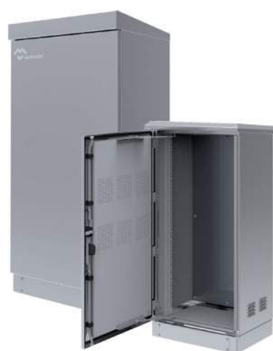
OUTDOOR TELECOM 19 RACKS & CABINETS