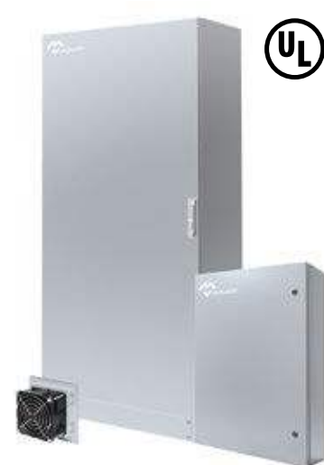
NEMA ELECTRICAL ENCLOSURES TYPE 1-3R-4X-12