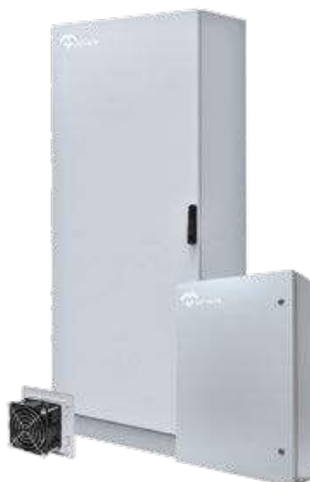
EMC ELECTRICAL ENCLOSURES SOLUTIONS