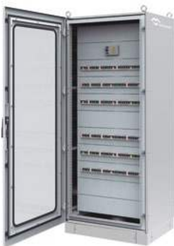
MODULAR DISTRIBUTION ENCLOSURES