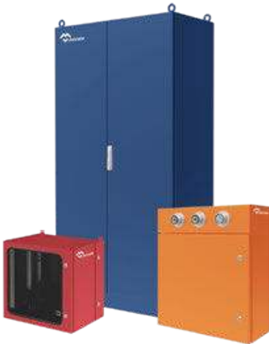
WATERPROOF SHEET STEEL ELECTRICAL ENCLOSURES