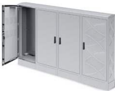
GLOBAL ELECTRICAL SOLUTIONS FOR URBAN AREAS