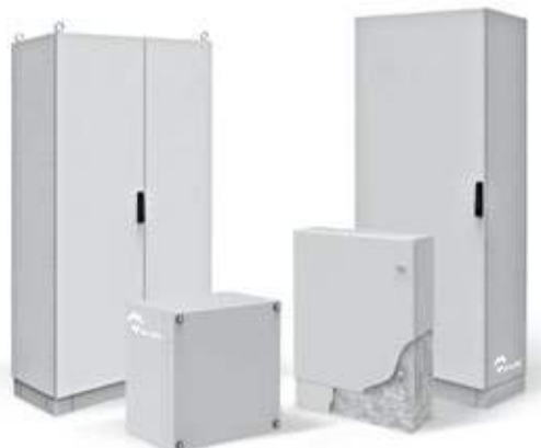
GALVANIZED STEEL ELECTRICAL ENCLOSURES