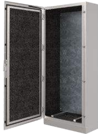
Tribeca without insulation