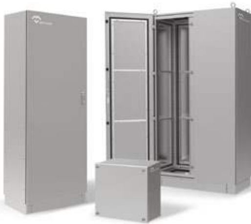
STAINLESS STEEL INDUSTRIAL ENCLOSURES

In Delvallebox we bear in mind that customers perceive the quality very clearly. In every product (for instance, in the cabinets here presented) safety and useful solutions are what customers value most.