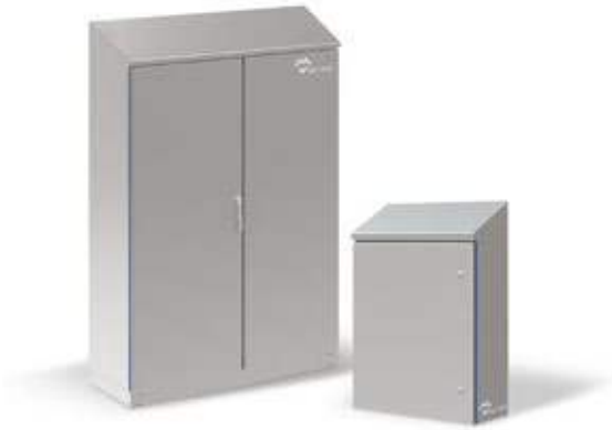
SLOPED ROOF ENCLOSURES - HYGIENIC