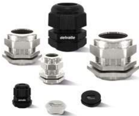
CABLE GLANDS FOR ELECTRICAL ENCLOSURES