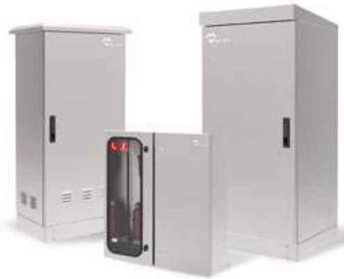
OUTDOOR ELECTRICAL ENCLOSURES