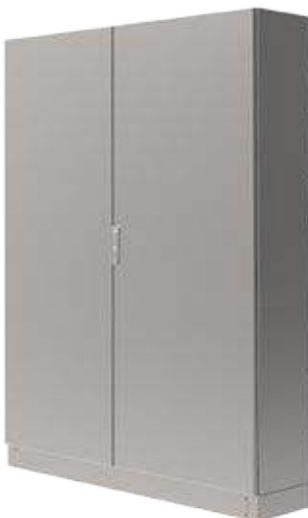
Tribeca with double doors