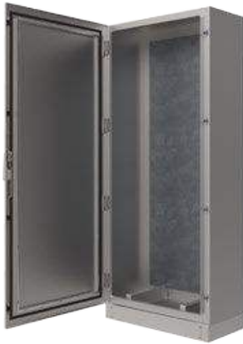
Tribeca with insulation