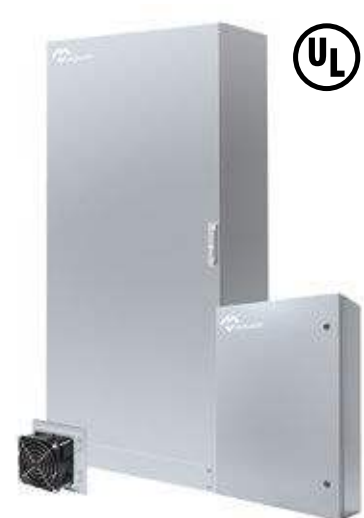
NEMA ELECTRICAL ENCLOSURES TYPE 1-3R-4X-12