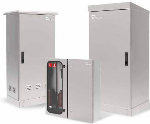
OUTDOOR ELECTRICAL ENCLOSURES