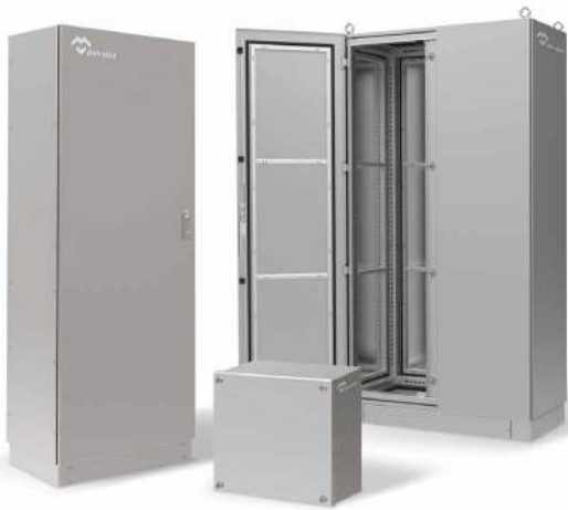
STAINLESS STEEL INDUSTRIAL ENCLOSURES

In Delvallebox we bear in mind that customers perceive the quality very clearly. In every product (for instance, in the cabinets here presented) safety and useful solutions are what customers value most.