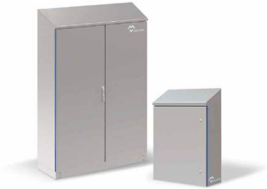
SLOPED ROOF ENCLOSURES - HYGIENIC