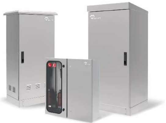
OUTDOOR ELECTRICAL ENCLOSURES