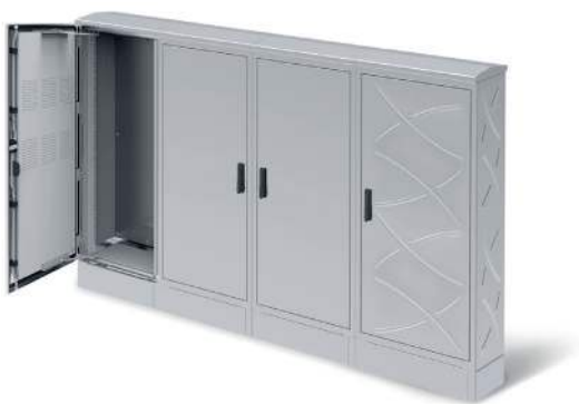
GLOBAL ELECTRICAL SOLUTIONS FOR URBAN AREAS