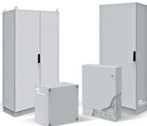
GALVANIZED STEEL ELECTRICAL ENCLOSURES