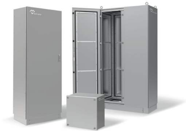
STAINLESS STEEL INDUSTRIAL ENCLOSURES

In Delvallebox we bear in mind that customers perceive the quality very clearly. In every product (for instance, in the cabinets here presented) safety and useful solutions are what customers value most.