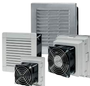
FANS WITH FILTER