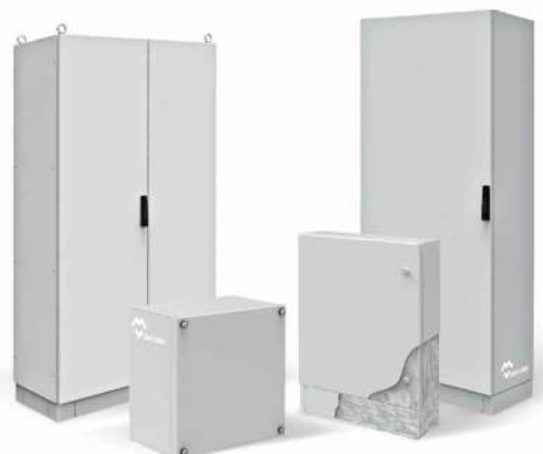
GALVANIZED STEEL ELECTRICAL ENCLOSURES