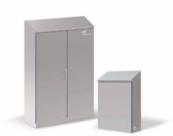
SLOPED ROOF ENCLOSURES - HYGIENIC