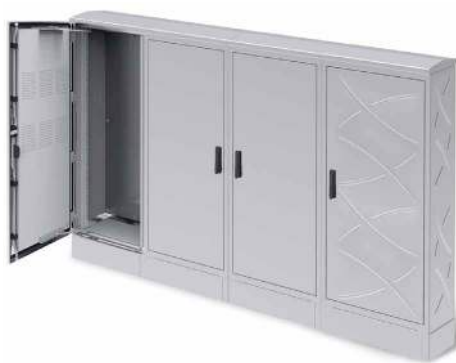
GLOBAL ELECTRICAL SOLUTIONS FOR URBAN AREAS