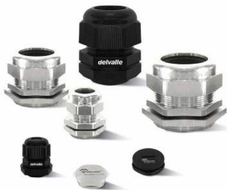
CABLE GLANDS FOR ELECTRICAL ENCLOSURES