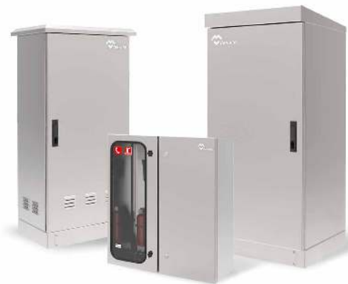
OUTDOOR ELECTRICAL ENCLOSURES