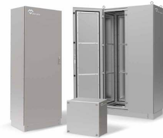
STAINLESS STEEL INDUSTRIAL ENCLOSURES

In Delvallebox we bear in mind that customers perceive the quality very clearly. In every product (for instance, in the enclosures here presented) safety and useful solutions are what customers value most.